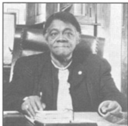
Mary McLeod Bethune