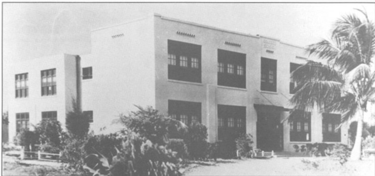
The Old Dillard School, 1001 Northwest Fourth Street, Fort Lauderdale, 1942.