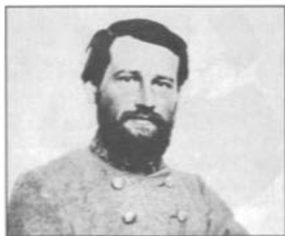
Stephen D. Lee wearing the uniform of a Confederate colonel.