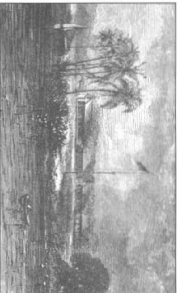
Fort Dallas, as it appeared in the years immediately following the Civil War.

On the 29th Lt. Childs was detached from the company, & with the mounted party as before scoured the country on the east of the road & south of that River. On the 30th left the train about six miles below the Hillsboro, took a westerly course to the swamp, skirted the Cypress for about three miles, then proceeded in a south Easterly direction to New River. On the 31st marched with the Train to Arch Creek. April 1st leaving the train proceeded in a westerly direction to the Everglades & skirted along the everglades between Arch Creek & Little River. Came upon an old Indian Encampment at the head waters of Little River & another about two miles lower down, neither had been occupied for a long time. Crossing Little River at the first practicable point, proceeded on a South easterly direction reaching this post