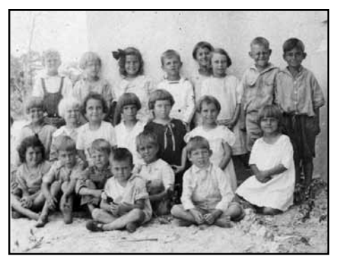
West Side Elementary School First Grade Class, 1923.