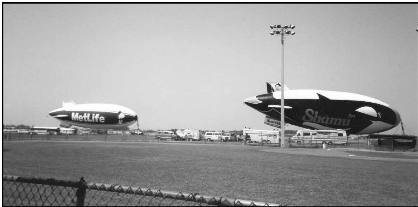
MetLife Snoopy Blimp and Sea World Shamu Blimp moored at North Perry Airport, c. 1990s. Spectators can go to the rear of the Paul Maxwell Park baseball field and get a close-up view of the blimps as they come and go from their moorings.

continue to evolve, updating facilities as needed and adding others that are desired. The city has faithfully followed its slogan: Join us — Progress with us.