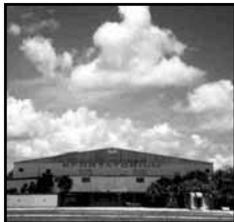
The Sportatorium, c. 1990

Until 2008, the most historic structure in Pembroke Pines was the original