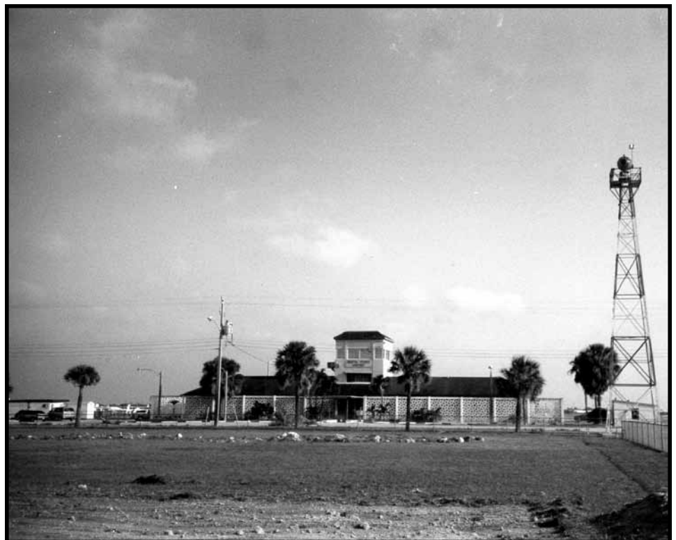
North Perry Field Administration Building and Control Tower, c. 1989

The dramatic economic downturn has caused a temporary halt to the development of the City Center. But, the central location on prime property on our main street should in the near future attract major developers to complete the project. As it has in the past, the city will