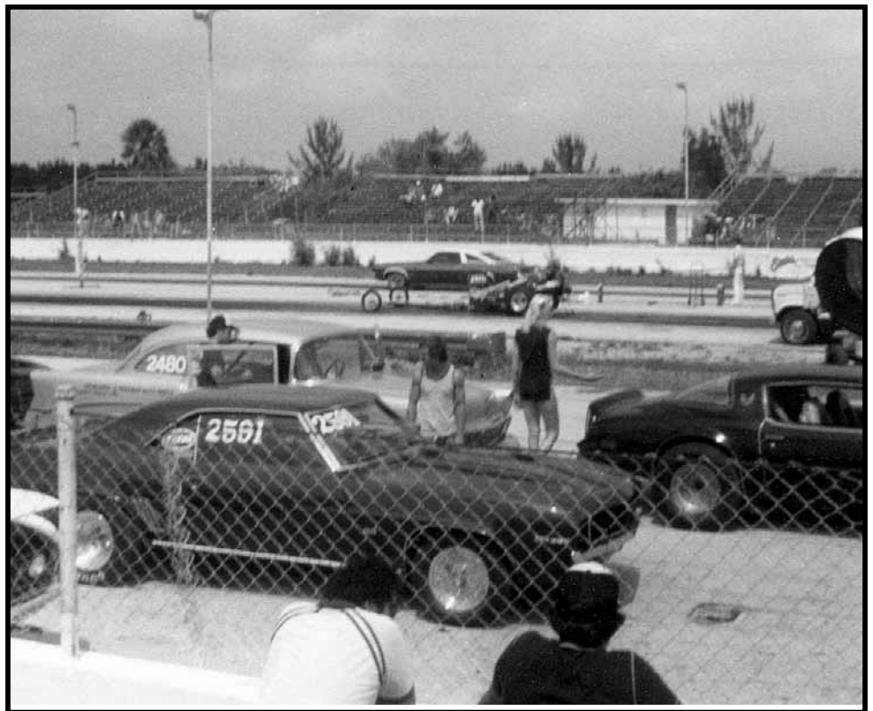
Miami-Hollywood Speedway Park, c. 1977

The concerts were initiated in 1970 in the 15,000-seat, cement block structure with a corrugated metal roof. It had no air conditioning in its early years and the one installed in 1976 did little to