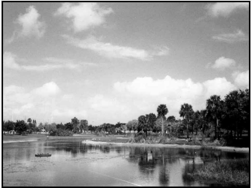
Broward County Community College Lake, 1988

In December 1974, in response to inquiries to FAA officials, an announcement came from Washington that the land transfer was totally unacceptable and no action had been taken. Later that