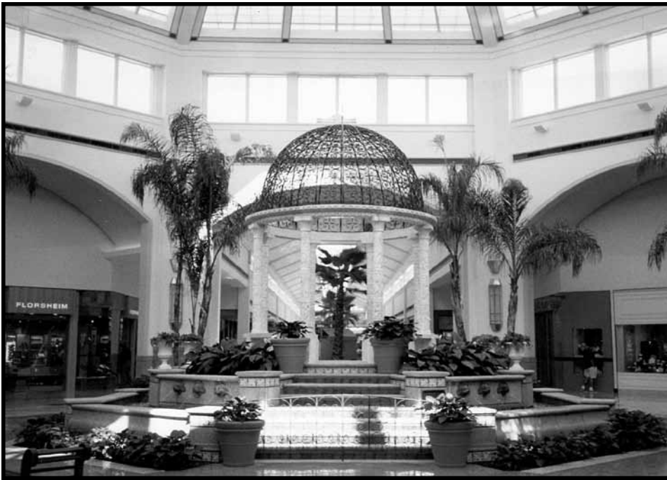
Imported Italian gazebo in Pembroke Lakes Mall, 1993

Headline, Hollywood Sun-Tattler , February 24, 1976: “FAA REJECTS BCC LAND PURCHASE.” Stalling once again, the FAA said the October 1975 appraisal did not reflect the land’s fair market value, and the edge of an airport was not suitable for a campus. An April 18 meeting between FAA and school officials was held at the county courthouse to resolve differences.