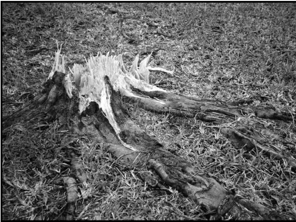
The Fury of the Storm, Broward Community College South Campus, January 16, 1991