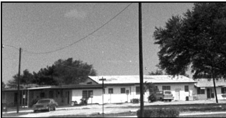
First City Hall, completed in 1960, SW 13 Street at SW 67 Way, c. 1980

The building was expanded over the years. The police station annex, built by the department personnel, and a utility department office were added on. A