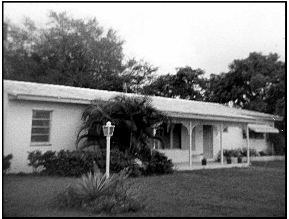
Kipnis Home, Southwest 69th Avenue at Southwest 13th Street, c. 1982

With all the problems previously outlined, plus many more that were not mentioned, it would seem that at times Pembroke Pines was a malfunctioning community, but this was not so. In the early years controversies were common, but at the same time the city was growing and capably handling its affairs. The elections that were called too often in the city's infancy, many of them on Saturdays, finally settled down to one spring election every two years, plus the mandatory fall state and national elections. The Board of Adjustment is doing its duty without interference. The Charter Board, having done its major job of refining the city's operating document, is now appointed