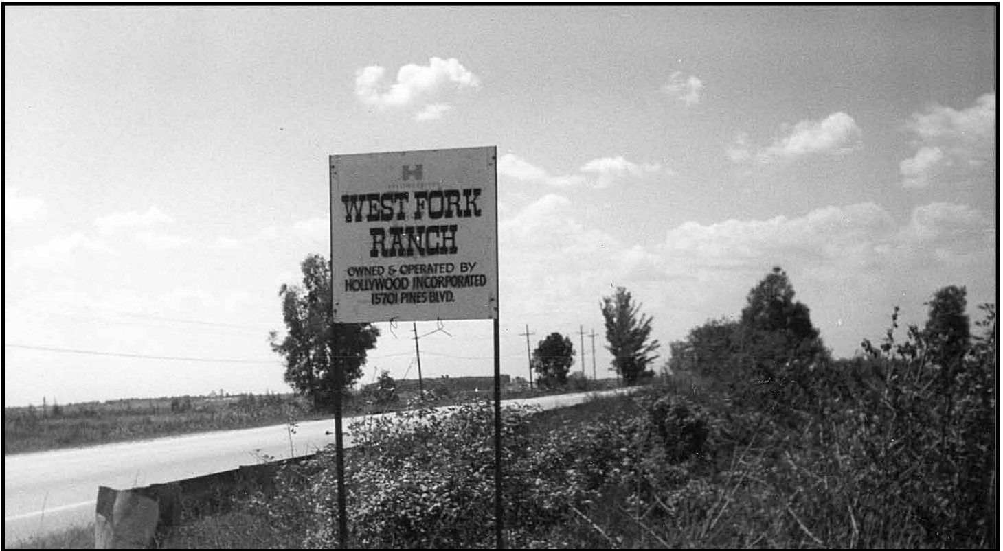
West Fork Ranch, c. 1990

engines splitting the country air. Non-professionals could bring their “souped up” cars and try them out on the quarter-mile track.