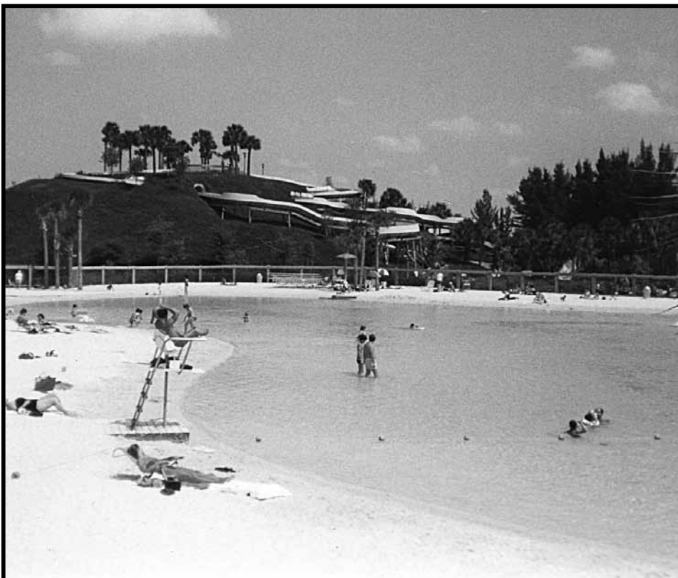
Beach, Pool, and Water Slides at CB Smith Park, a Broward County Park in Pembroke Pines, 1982