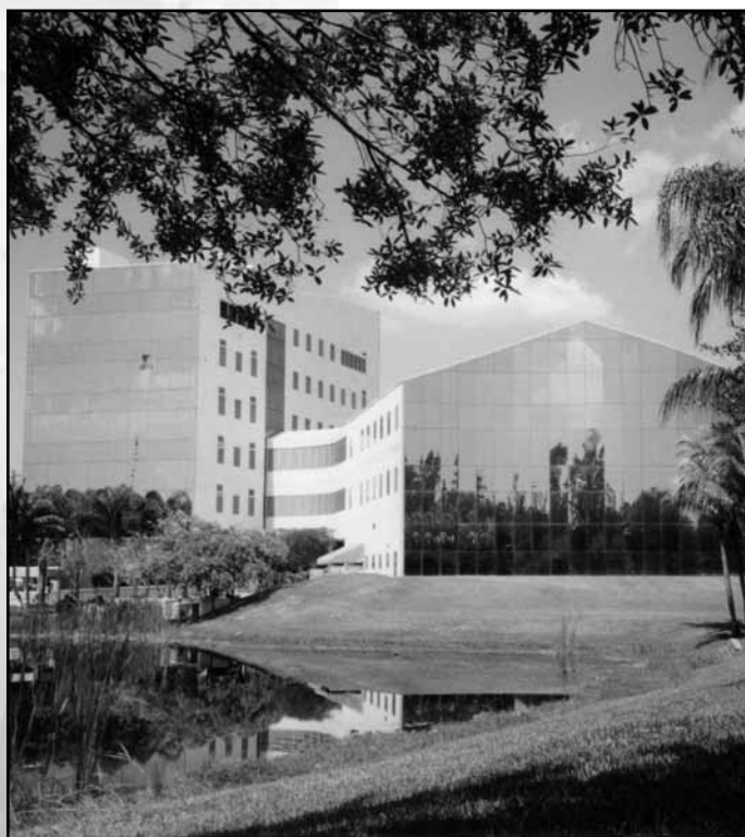
Pembroke Pines City Hall, south view 2001