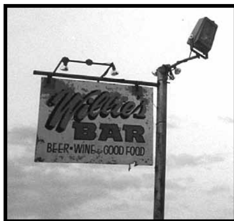
Willie's Bar, c. 1990

The trip to the Sportatorium was an adventure in itself; the road was a narrow, two-lane asphalt Hollywood Boulevard, originating at the ocean in Hollywood and continuing due west to U.S. 27, the north-south route from Miami to Lake Okeechobee. Some of the ticket holders would approach from the east, clogging the "main street" of Pembroke Pines for miles, from the Florida Turnpike and U.S. 441. Others would drive north on U.S. 27 and turn east on western Hollywood Boulevard to reach the Sportatorium.