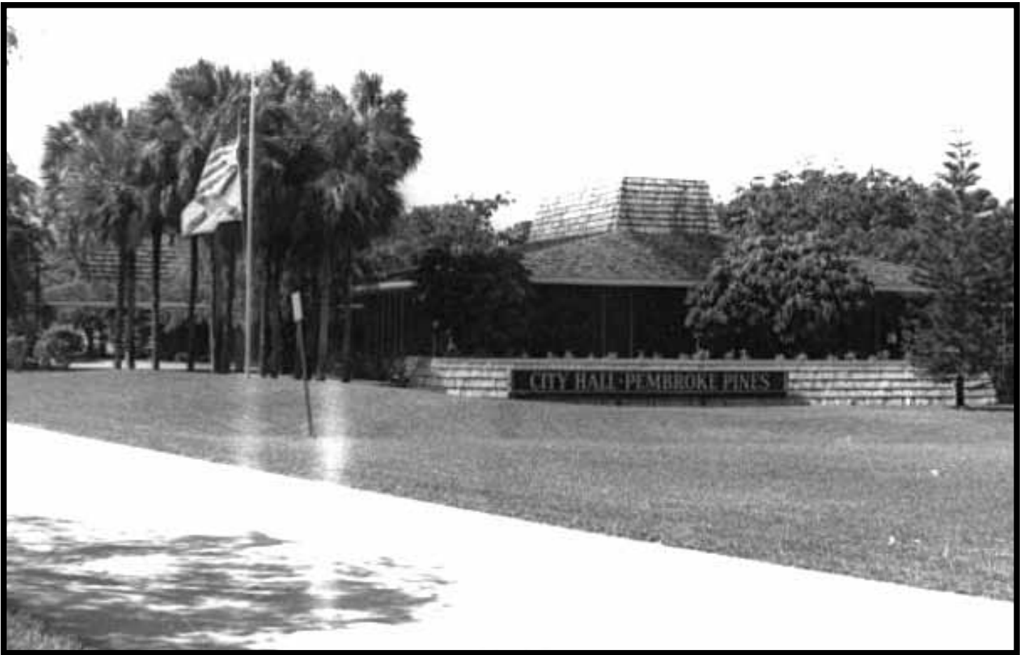
Pines City Hall, Taft Street west of Palm Avenue, former showrooms of Pembroke Lakes Subdivision, c. 1976-1988

second small building served as city department offices, and eventually as the city-operated library.