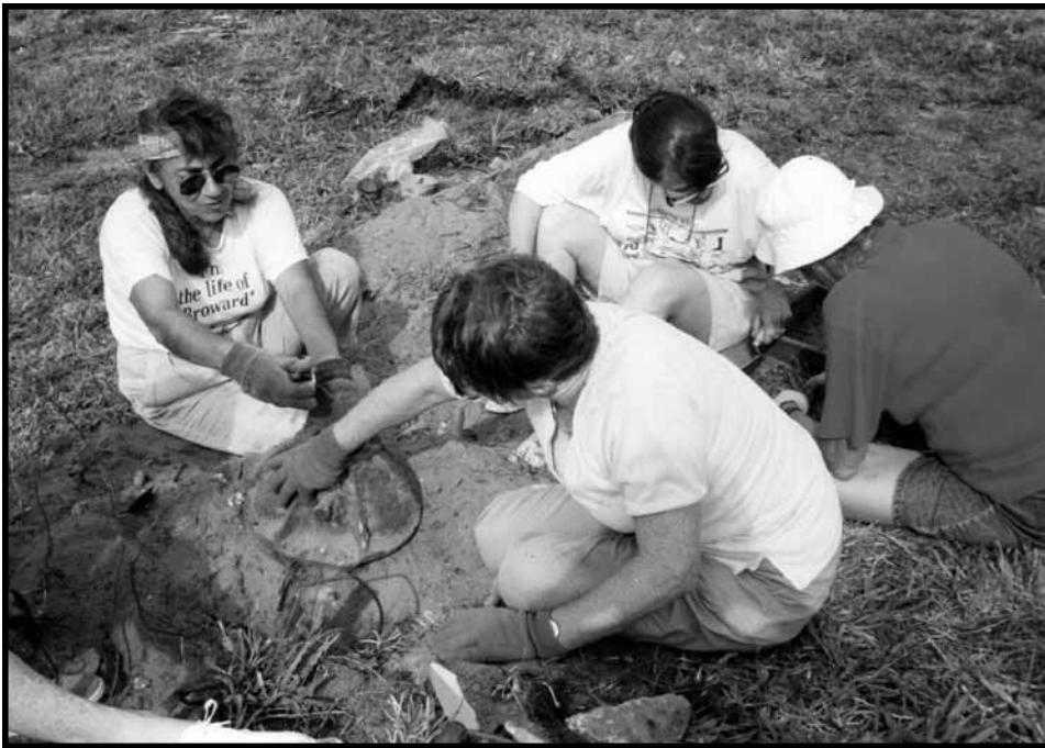
Broward County Archaeological Society Participants in North Perry Airport Digs, 1989

new Southwest Focal Point Senior Center was established in 1995. The old senior center/city hall was then remodeled into the Village Community Center. Now the Early Childhood Development Center uses the facility. A part of the building is appropriately used as the Pembroke Pines Historical Museum. The city hall on Taft Street is now just a memory, as it was torn down in the spring of 2005. The site is now Ben Fiorendino Pembroke Lakes Park, to honor a former mayor and city commissioner. The first police station was a tiny addition to the old city hall, built mostly by a handful of police officers. Eventually, the city acquired property at 9500 Pines Boulevard and built the current Pembroke Pines Police Department headquarters. Adjacent to the police department is the Pembroke Pines Fire Department headquarters. With its more than 200 employees and six stations, the fire department is rated a Class A organization.