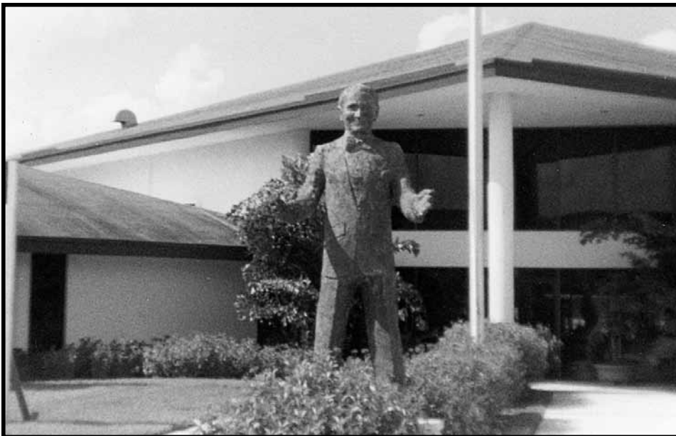
Statue of the late Red Buttons, nationally recognized stand-up comedian and actor, and advertising spokesperson for Century Village, c. 1970s

Now the campaign to "sell" the proposal to the public was begun. A political action committee (PAC) was created by Mayor Flanagan with advice