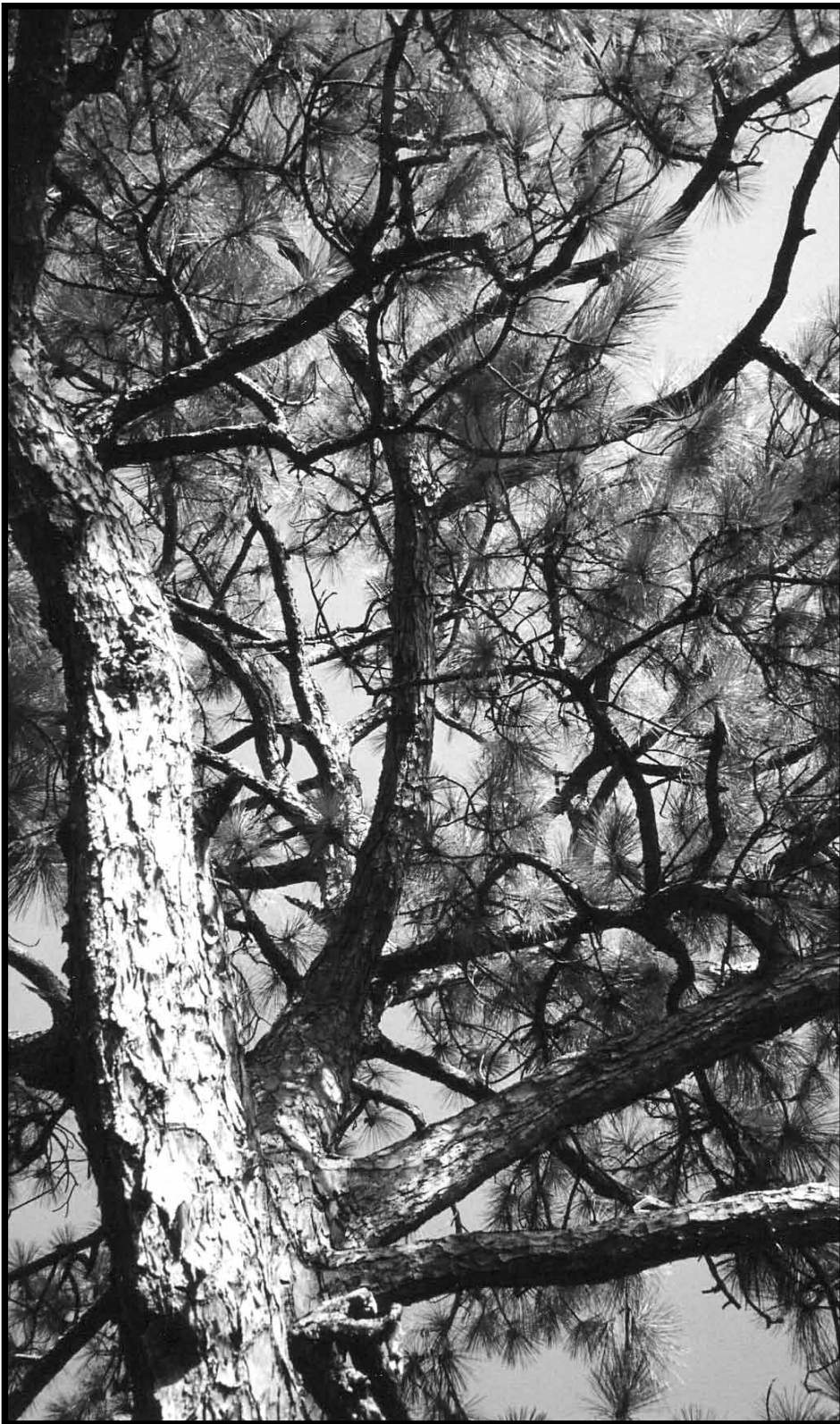
Pinus Elliottii, var densa, c. 1980.