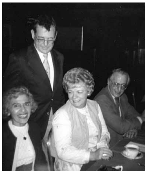
Pembroke Pines Civic Association Farewell Dinner, 1982.