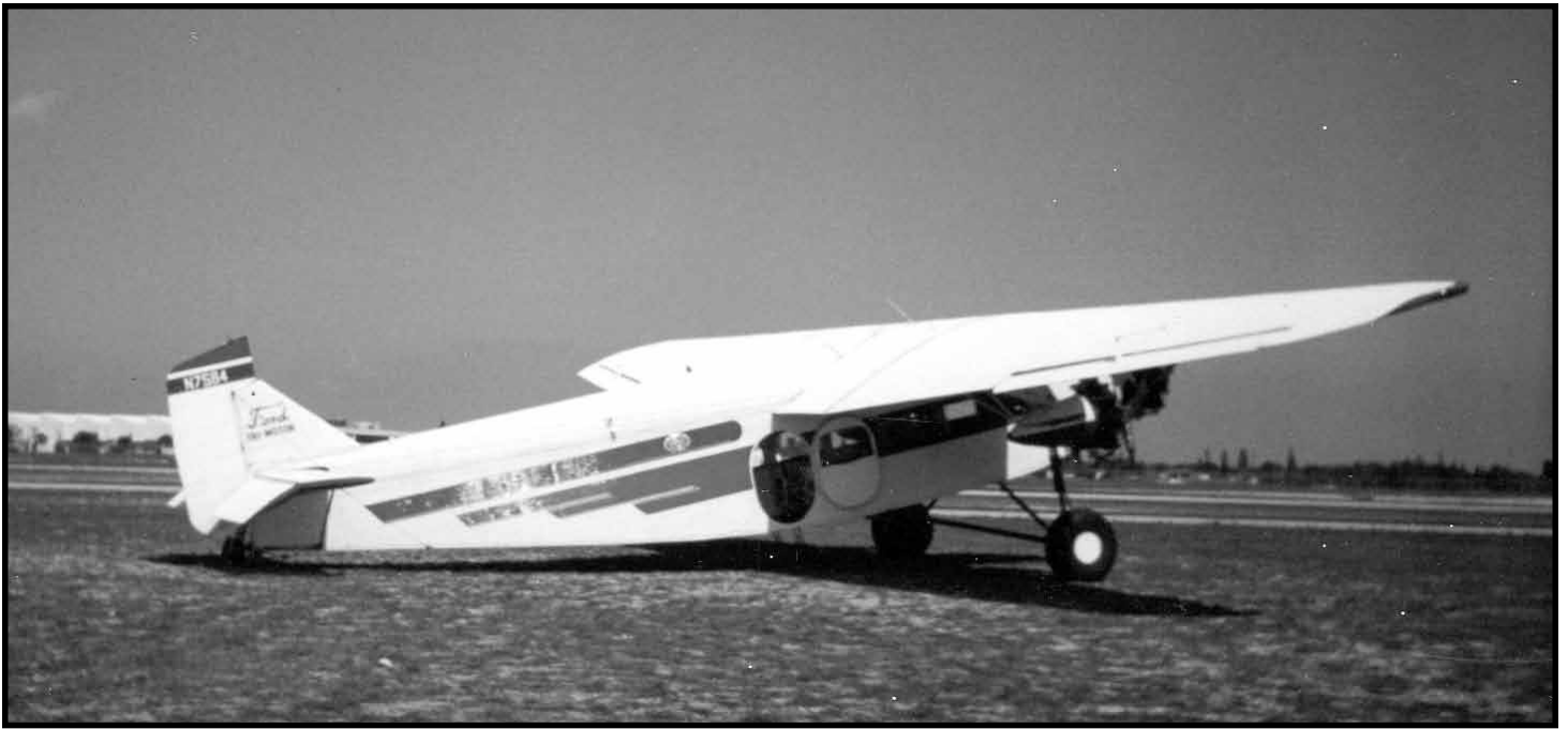
Ford Tri-Motor plane, c. early 1990s

of the Florida Turnpike on Hollywood Boulevard. Usually we would drive to Publix grocery stores several miles away. The closest pharmacy was on State Road 441.