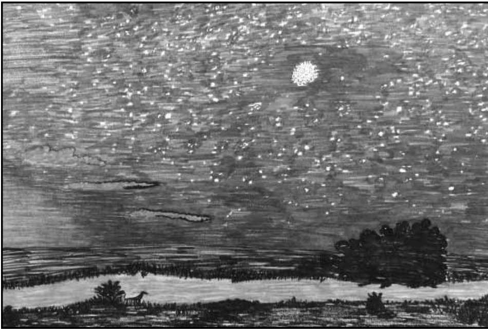
Halley's Comet, April 1986

It seemed like we had elections far too often. In 1961, an appointed charter review board wrote our city's operating legal document. But some residents insisted that the board should have been elected, not appointed. So an election was held to elect a Charter Review Board to write our charter, which in turn had to be approved with very few changes at an election.