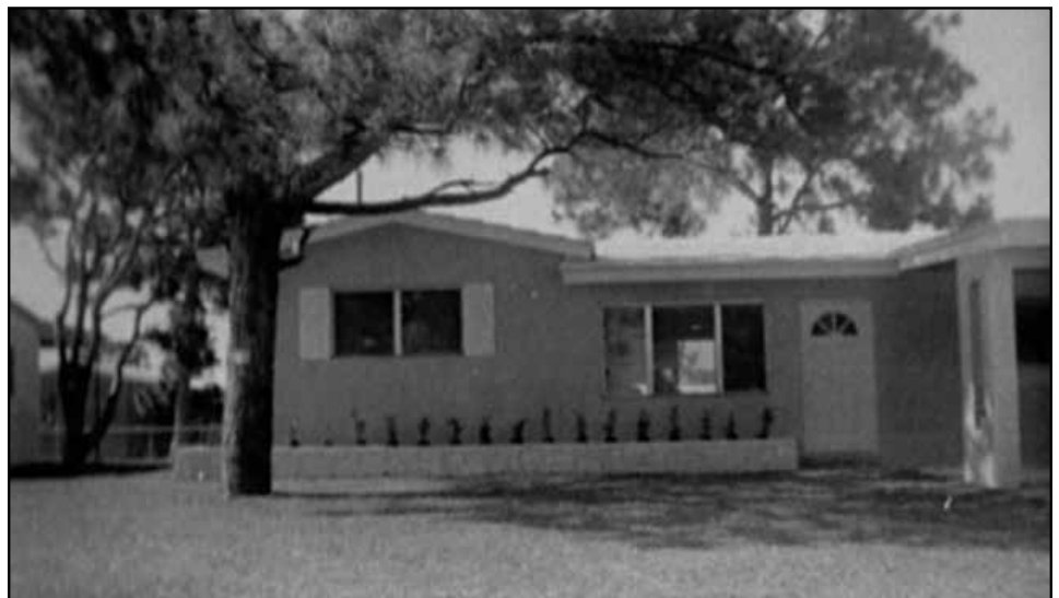
Pines Village Residence in Original Pembroke Pines Plat #2, 1957.

We were fortunate to have Pines Elementary School built a few blocks east at Southwest 9th Street and Southwest 66th Avenue. Mary, John, Mike and our fourth son, Tom could walk the few blocks to the school. The Pines Village area eventually expanded with the building of the Pasadena Homes from Southwest 9th Street to Hollywood Boulevard. Southwest 72nd Avenue was extended from Southwest 9th Street to Hollywood Boulevard, whereas before we had to drive to Pembroke Road, east to State Road 441 and then north to the small shops just west