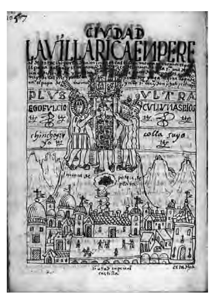
Figure 5. La villa rica enpereal de Potocchi, drawing 375 from Poma, Primer nueva corónica y buen gobierno, 1615; National Library of Denmark and Copenhagen University Library.