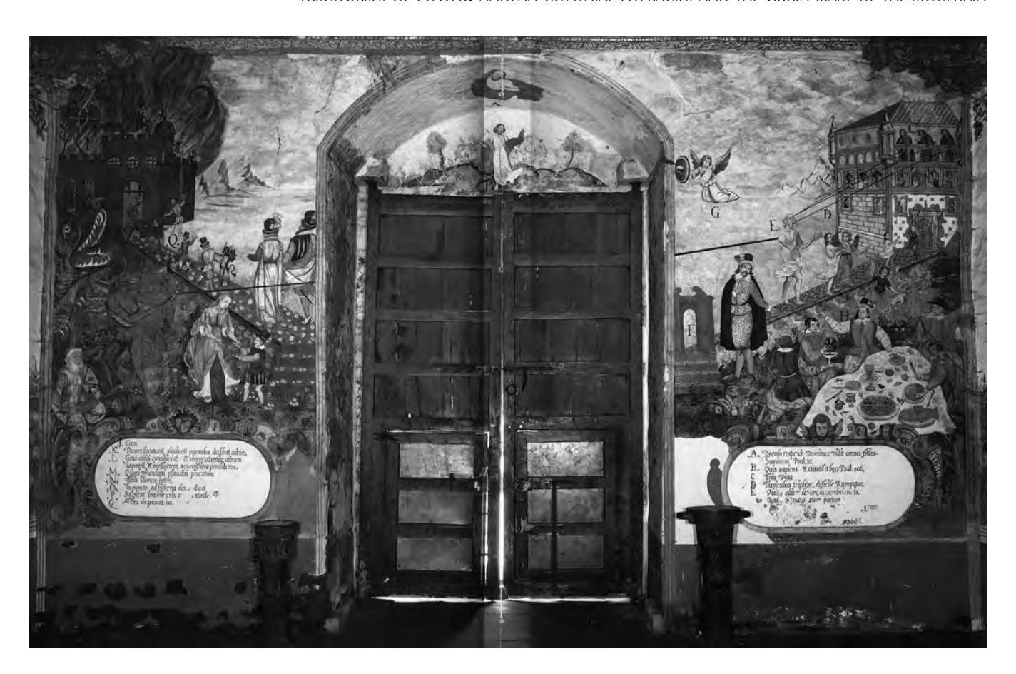
Figure 6. Luis de Riaños, The Road to Hell and The Road to Heaven, c.1618-26, fresco. Church of San Pedro, Andahuaylillas, Department of Cuzco, Peru.