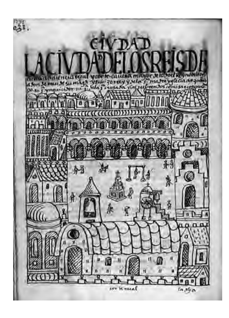
Figure 3. Guaman Poma de Ayalá, Ciudad de Los Reyes de Lima , drawing 362 from Poma, Primer nueva corónica y buen gobierno , 1615; National Library of Denmark and Copenhagen University Library.