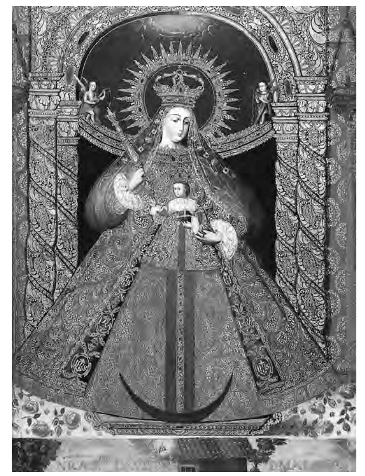
Figure 7. Luis Nino, Our Lady of the Victory of Málaga, oil on canvas, region of Potosí, c. 1735.