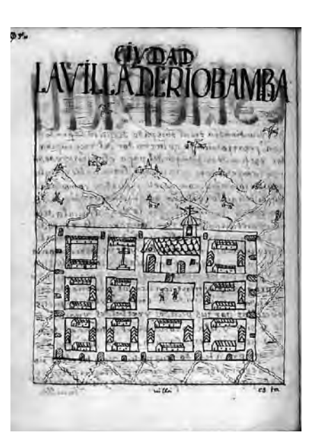
Figure 4. La villa de Riobamba, drawing 349 from Poma, Primer nueva corónica y buen gobierno, 1615; National Library of Denmark and Copenhagen University Library.