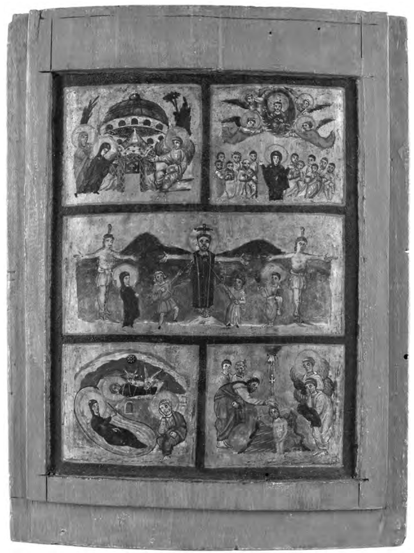
▶ Figure 9. Top left, Tomb of Christ, surmounted by the Rotunda. Reverse of lid from pilgrim's box with stones from the Holy Land, 6<sup>th</sup> century CE, created in Syria or Palestine, painted wood, stones, wood fragments, and plaster, h. 24 cm x w. 18.4 cm (overall), Museo Sacro Vaticana (inv. no. 61883a), Vatican State, Italy © Vatican Museum.

▶ Figure 8. The Fountain of Life, illuminated manuscript page from the Godescalc Gospels MS nouv. acq. nal. 1203 fol. 3v, c. 781-83 CE, Bibliothèque Nationale, Paris © The Art Archive at Art Resource, New York.