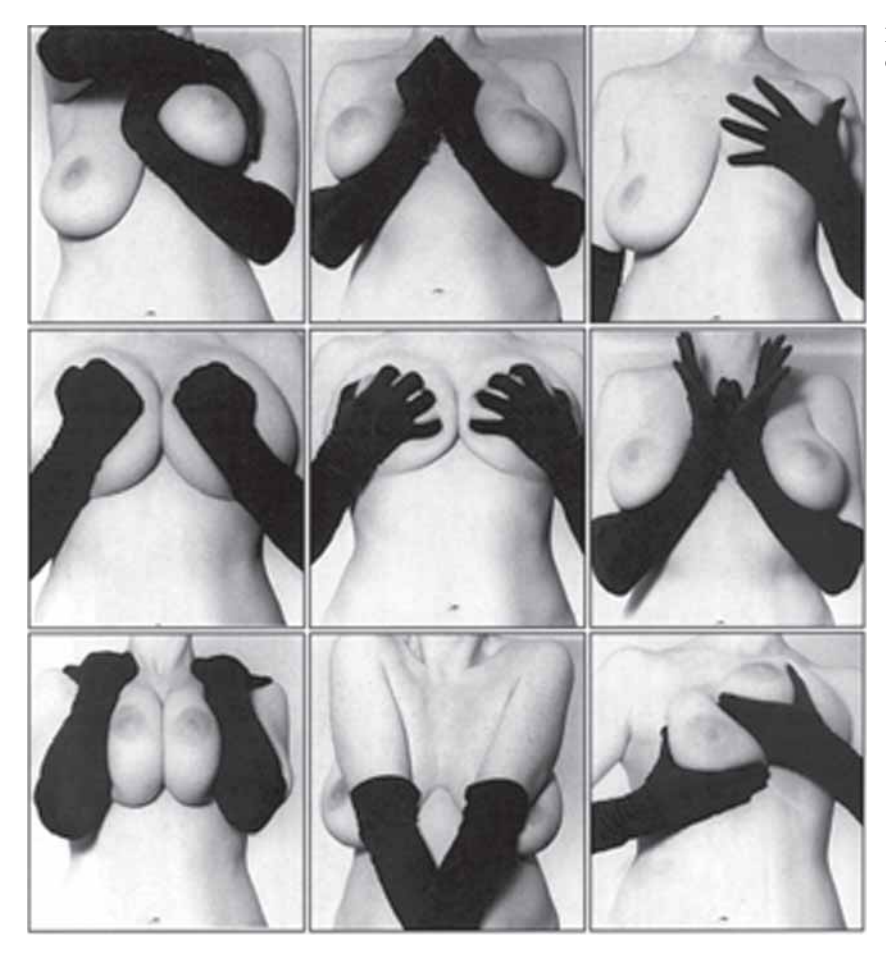
Figure 2. Annie Sprinkle, Bosom Ballet , 1991.