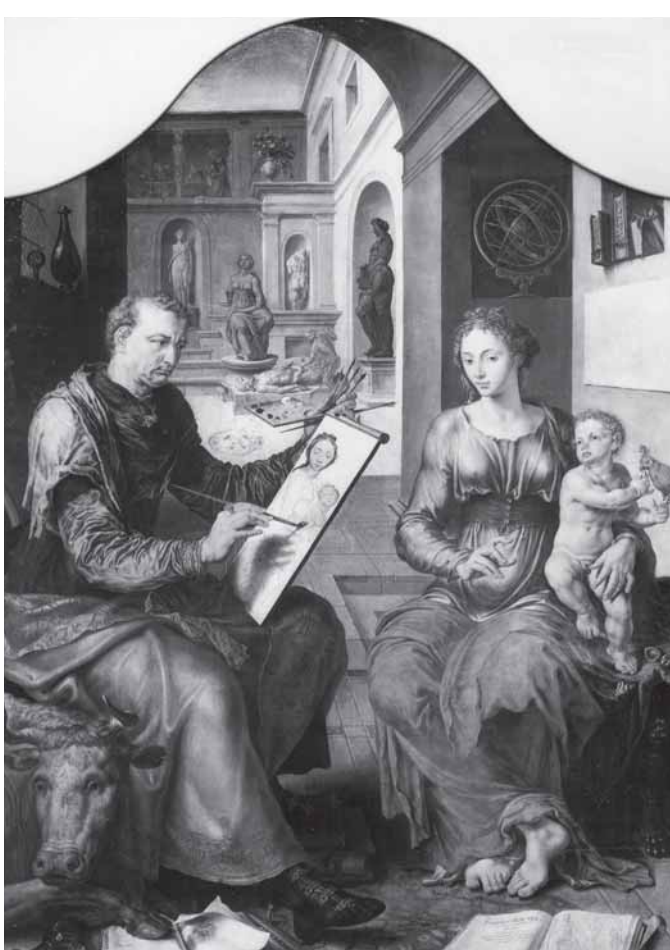
Figure 2. Maarten van Heemskerck, St. Luke Painting the Virgin , c . 1553, oil on panel, 158 x 144 cm, Musée des Beaux-Arts, Rennes, France.