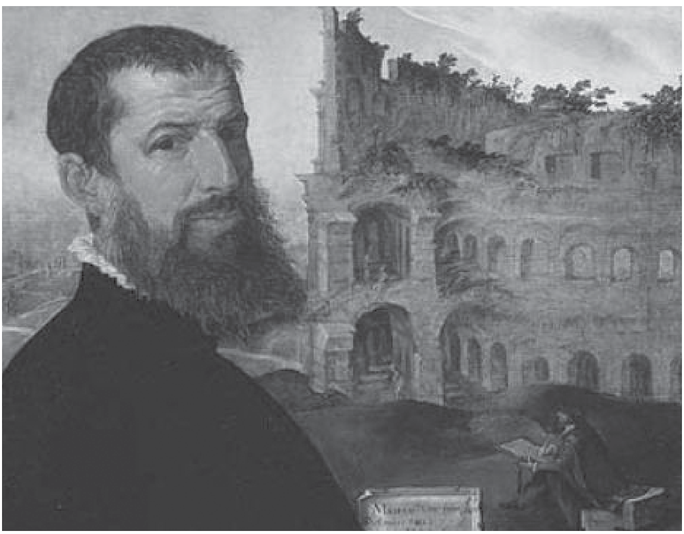
Figure~1.~Ma arten~van~Heemskerck, Self-Portrait~in~Front~of~Colosseum, 1553, oil~on~panel, 42.2~x~54~cm, Fitzwilliam~Museum, Cambridge.