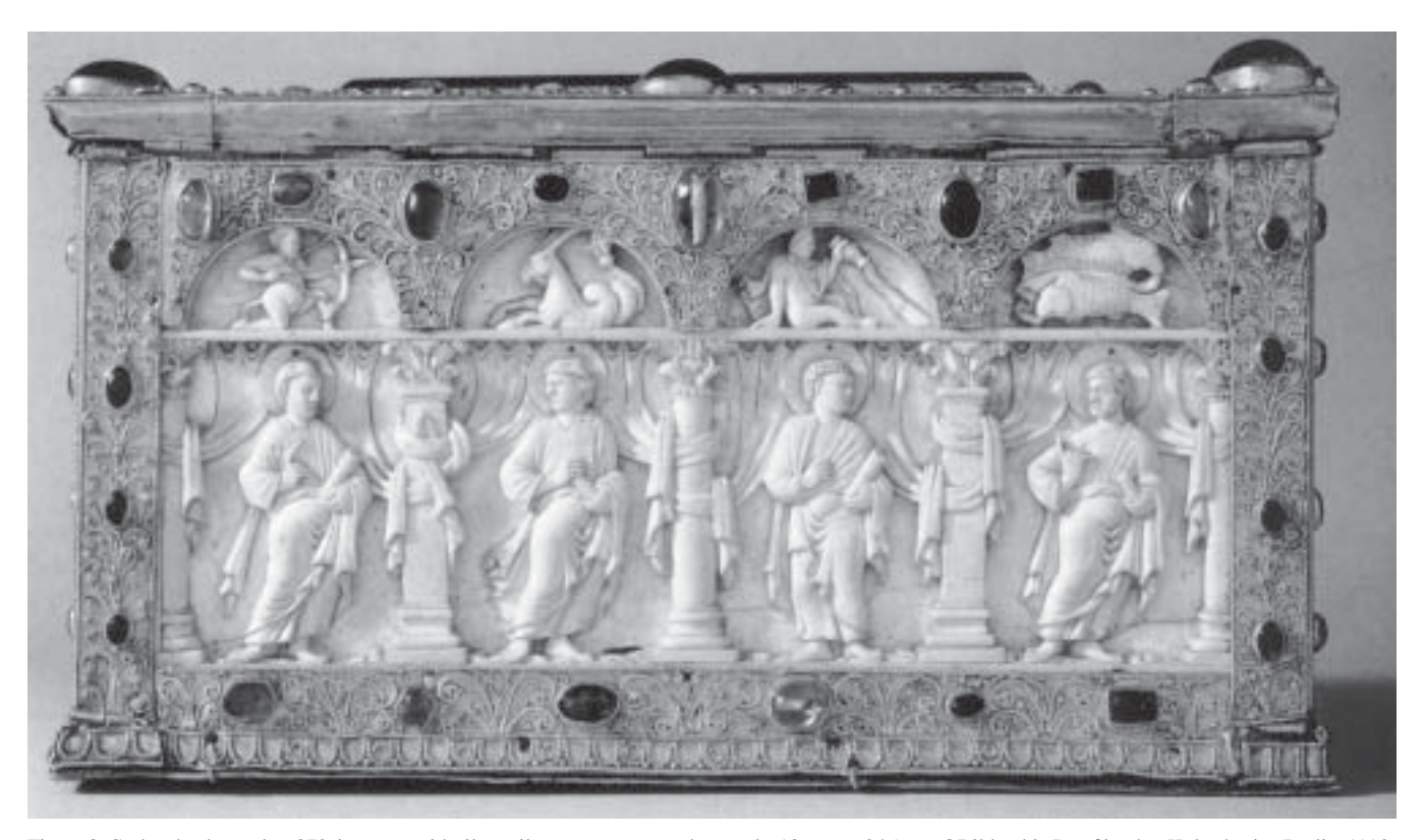
Figure 3. Casket, back panel, c. 870, ivory set with silver gilt mounts, gems and enamels, 13.6 cm x 24.9 cm. Quedlinburg, Stiftskirche.