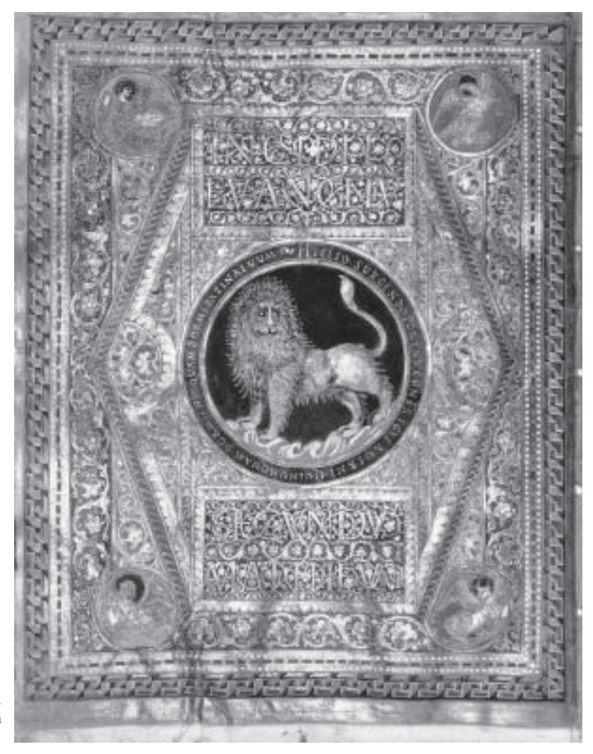
Figure 8. "Lion of Christ," Code Aureus of St. Emmeram, c. 870, fol. 16 verso, Munich, Bayerische Staatsbibliothek, Clm 14000.