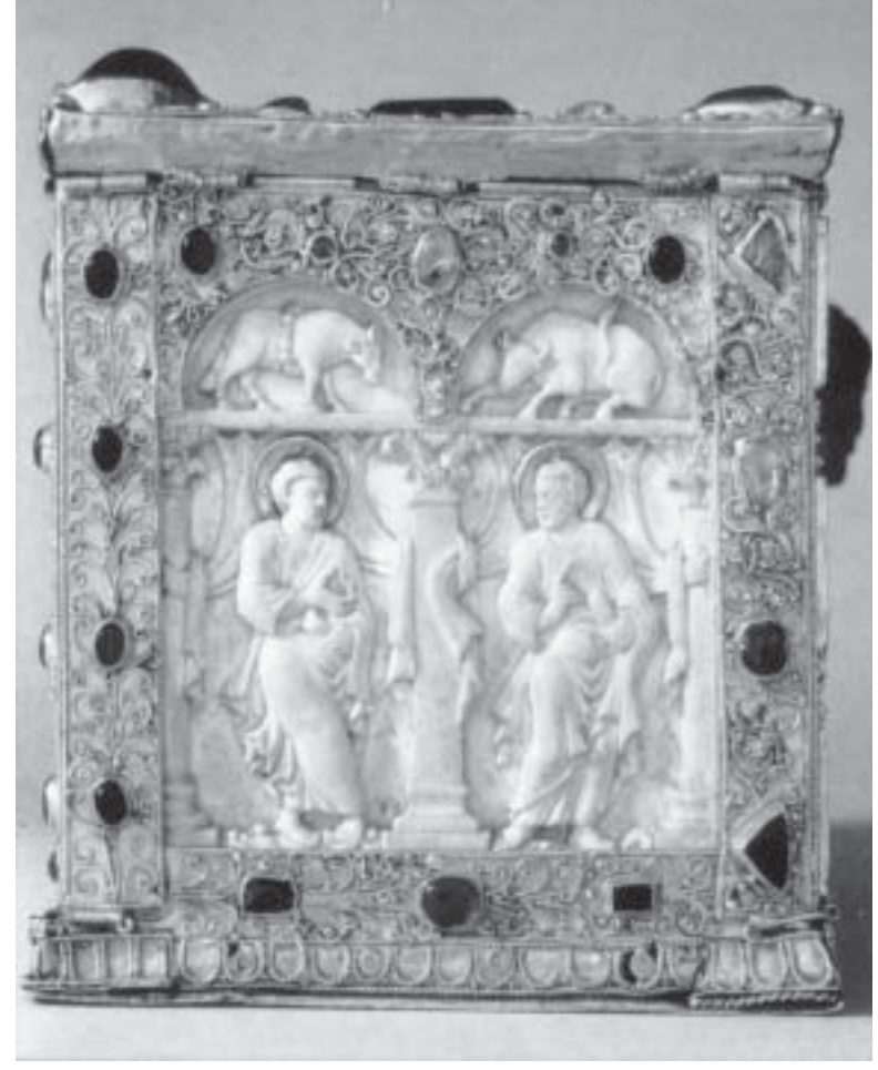
Figure 2. Casket, side panel, c. 870, ivory set with silver gilt mounts, gems and enamels, 13.6 cm x 12.4 cm. ©Bildarchiv Preußisscher Kulturbesitz, Berlin, 1992, Klaus G. Beyer, Quedlinburg, Stiftskirche.