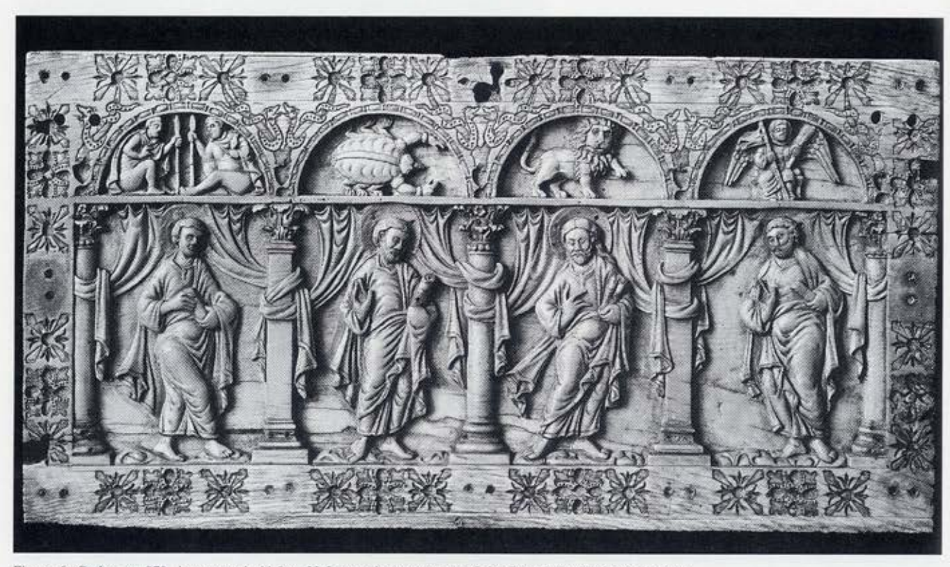
Figure 6. Casket, c. 870, ivory panel, 11.8 x 23.5 cm, photo courtesy of the Bayerische National Museum.