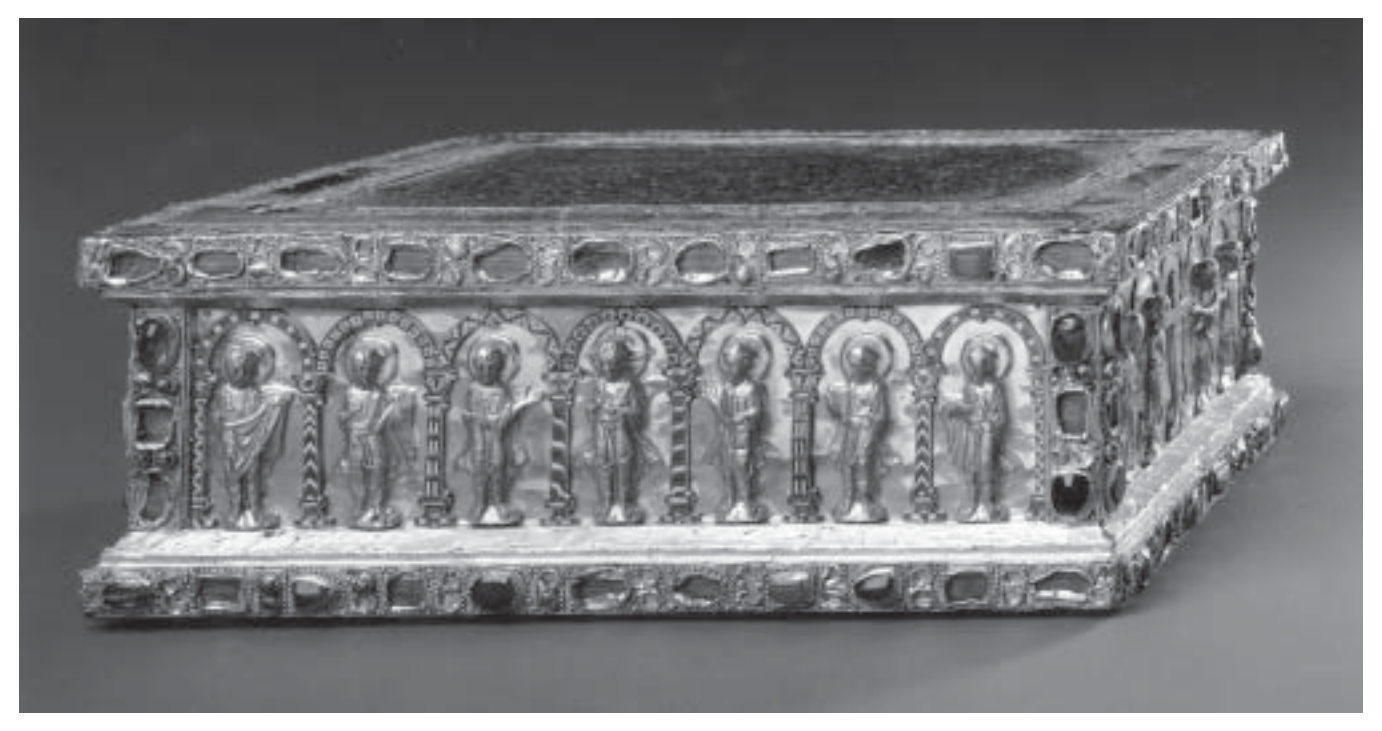
Figure 7. \ Portable \ Altar of Gertrud, c.\ 1030, gold, gems, pearls, and enamels, L.\ 26.6 \ cm. \\ Gift of the John Huntington Art and Polytechnic Trust, 1031.462.