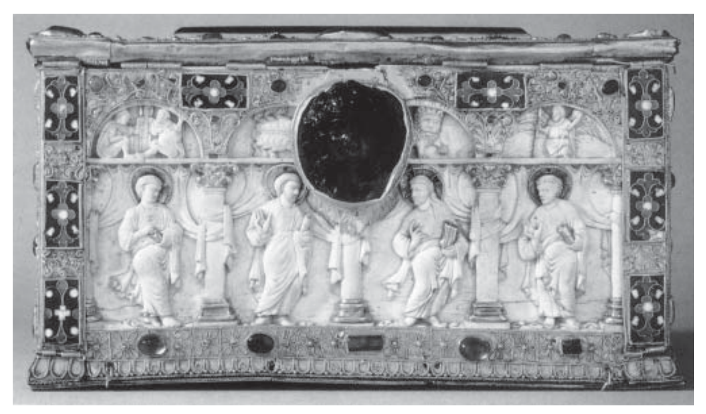
Figure 1. Casket, front panel, c. 870, ivory set with silver gilt mounts, gems and enamels, 13.6 cm x 24.9 cm. ©Bildarchiv Preußisscher Kulturbesitz, Berlin, 1992, Klaus G. Beyer, Quedlinburg, Stiftskirche.