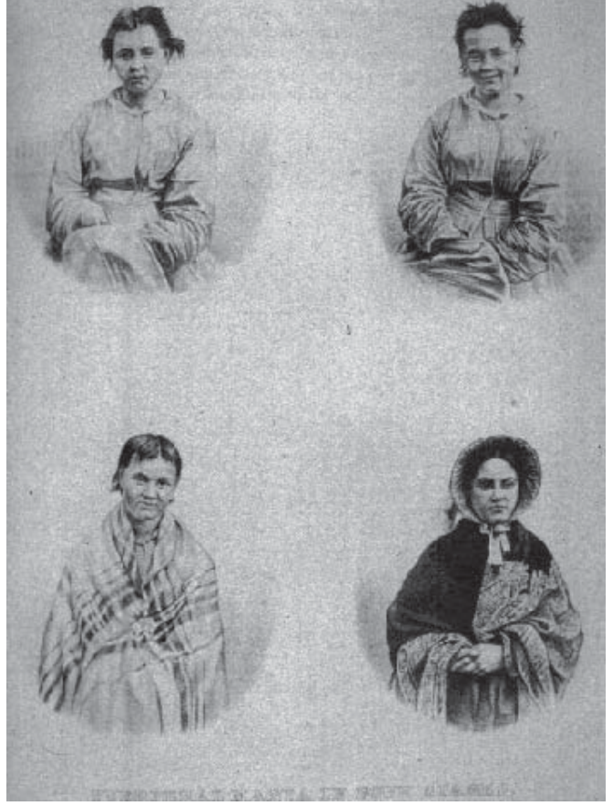
Figure 6. Anonymous, "Puerperal Mania in Four Stages," lithograph after Diamond photograph, 1848-58.