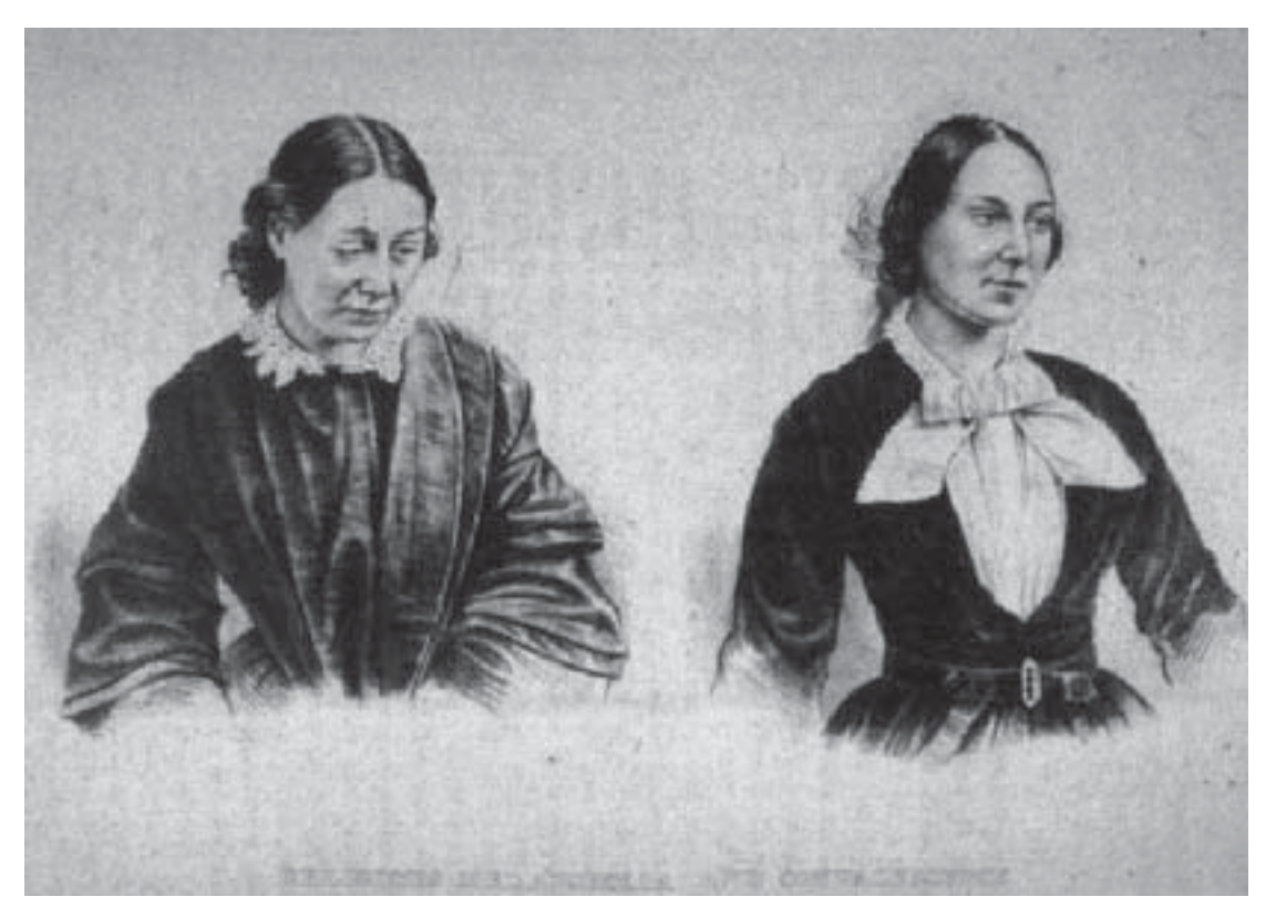
Figure 7. Anonymous, "Religious Melancholia and Convalescence," lithograph after Diamond photograph, 1848-58.