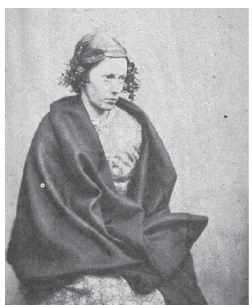
Figure 2. Hugh W. Diamond, Patient posed as Ophelia, photograph, 1848-58.