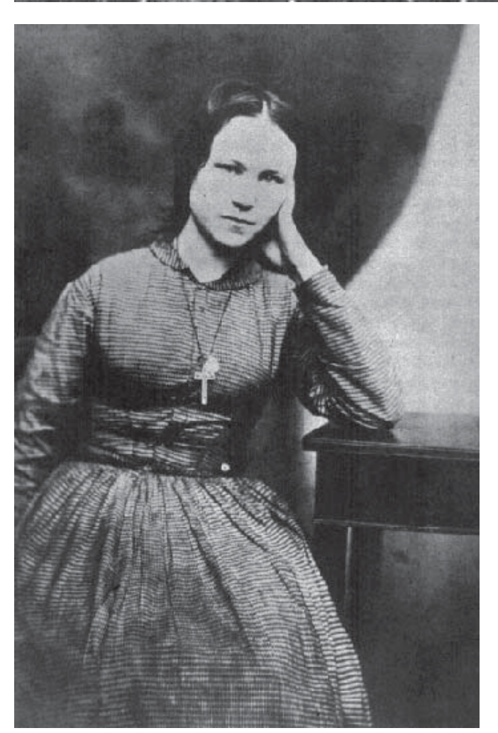
Figure 5. Hugh W. Diamond, Patient diagnosed with religious mania, photograph, 1848-58.