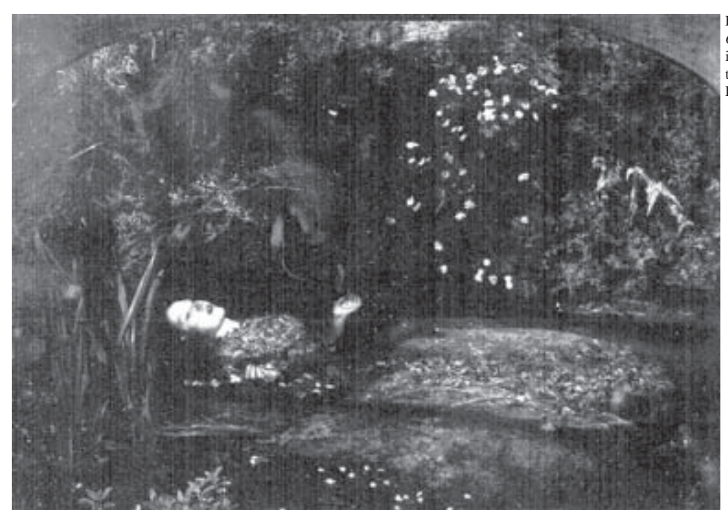
Figure 4. John Everett Millais, Ophelia , oil on canvas, 30 x 44 inches, 1852.