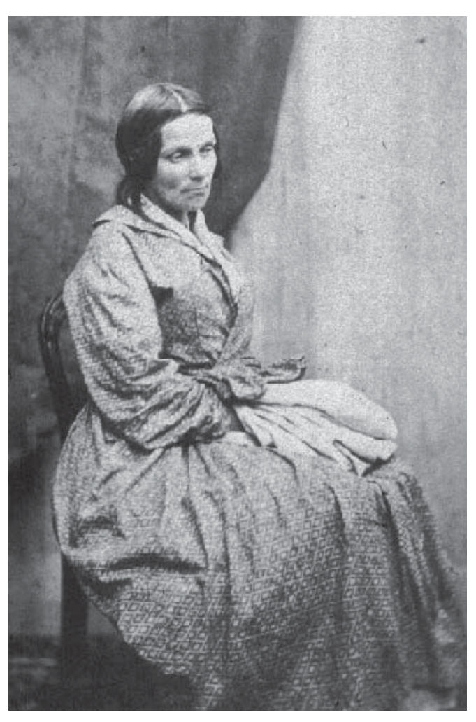
Figure 1. Hugh W. Diamond, Patient posed before drapery, photograph, 1848-58. Photograph courtesy the Royal Society of Medicine, London.