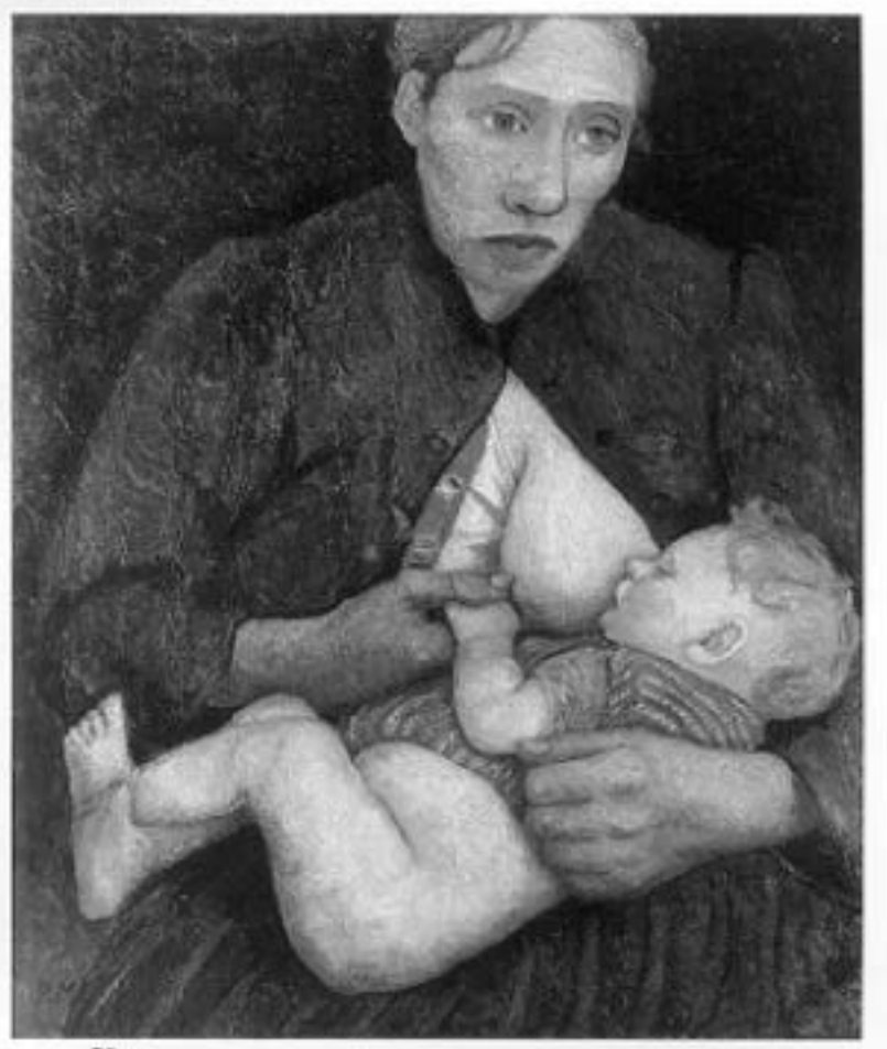
Figure 3. Paula Modersohn-Bocker, Silent Mother, 1903. Niederstichnisches Landesmuseum Hannover.

Figure 2. Paula Modersohn-Becker, Peasant Woman and Child, c. 1903. Hamburger Kunsthalle.