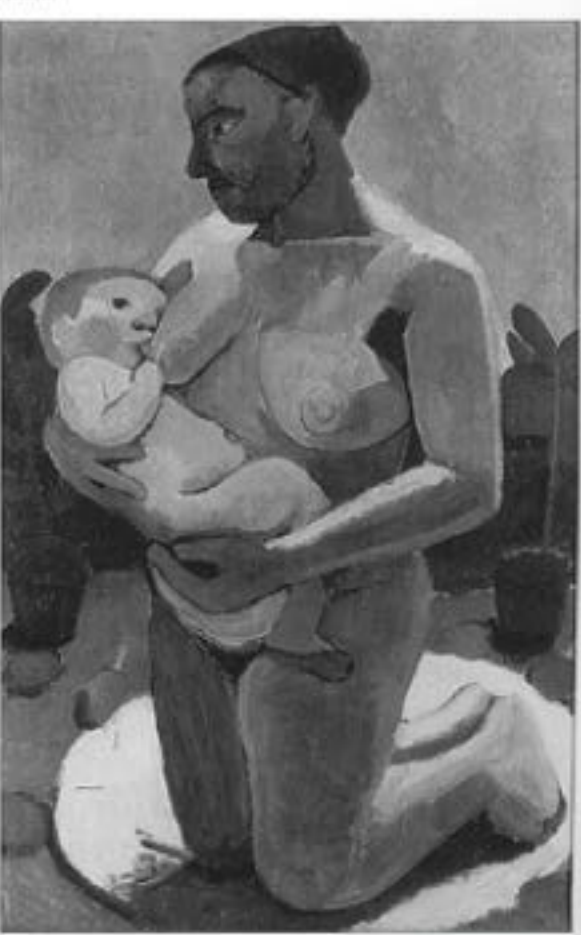
Figure 5. Paula Modersohn-Becker, Kneeling Mother and Child, 1907. Staatliche Museen zu Berlin Preussischer Kulturbestiz Nationalgaletic.