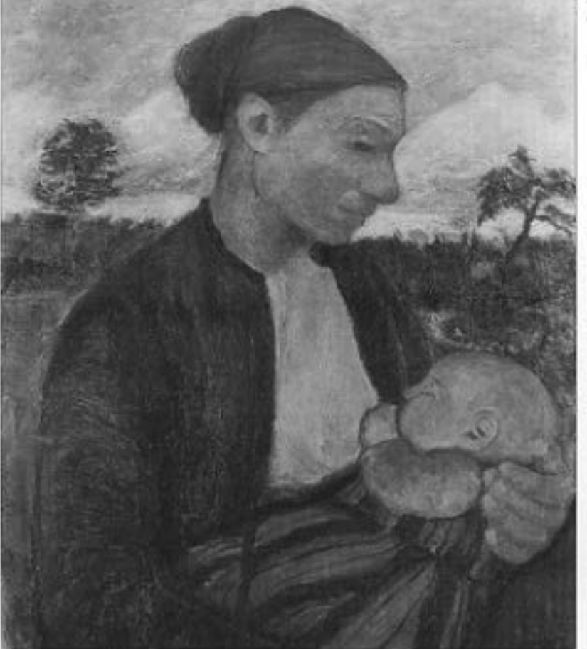
Figure 2. Paula Modersohn-Becker, Peasant Woman and Child, c. 1903. Hamburger Kunsthalle.