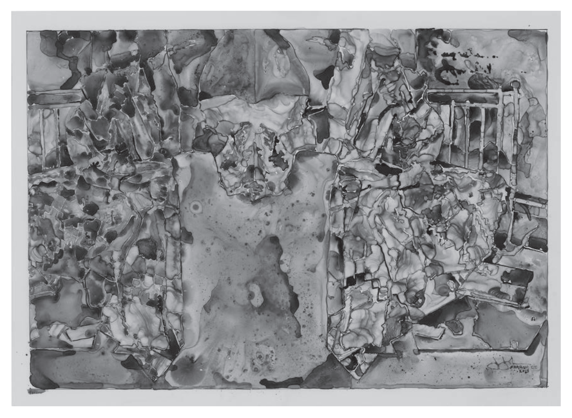
Figure 5. Jasper Johns, Untitled , 2013, ink on plastic, 27 1/2 x 36 inches. The Museum of Modern Art, New York. Promised gift from a Private Collection. Art © Jasper Johns / Licensed by VAGA, New York, NY / Courtesy Matthew Marks Gallery.