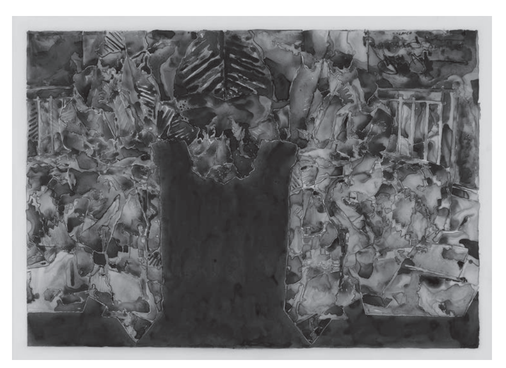
Figure 1. Jasper Johns, Untitled , 2013, ink on plastic, 27 1/2 x 36 inches. The Museum of Modern Art, New York. Promised gift from a Private Collection. Art © Jasper Johns / Licensed by VAGA, New York, NY / Courtesy Matthew Marks Gallery.