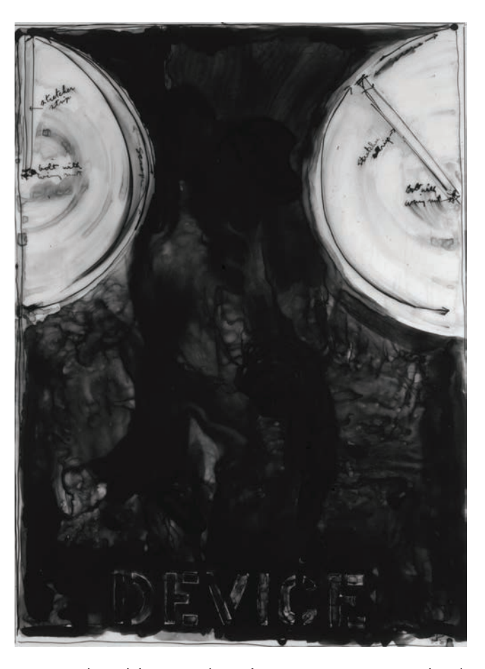
Figure 2. [above, left] Jasper Johns, After Larry Burrows, 2014, India ink and water-soluble encaustic on plastic, 32 x 24 inches. Art © Jasper Johns / Licensed by VAGA, New York, NY

Figure 3. [above, right] Jasper Johns, Device, 1962, ink on plastic, 24 \times 18 inches. Art © Jasper Johns / Licensed by VAGA, New York, NY / Courtesy Castelli Gallery, New York.