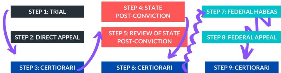
Figure 2. A general breakdown of the habeas corpus process in the state and federal system (Mathieson & Konrad, 2021). Flow chart created by author using information from the National Habeas Institute (NHI).

In Bell v. Cone (2002), the U.S. Supreme Court explained that AEDPA “modified a federal habeas court’s role in reviewing state prisoner applications in order to prevent federal habeas [‘retrials’] and to ensure that state-court convictions are given effect to the extent possible under law” (p. 693). Additionally, the Court asserted that federal habeas corpus is not available as a remedy for defendants “just because a state court decision may have been incorrect; instead, a petitioner must show that a state court decision was unreasonable[,] [an ambiguous term that the Court expects its daughter courts to decipher on their own]” (p. 694). AEDPA also mandates that, if a state court provides alternative reasons for denying a prisoner’s request for habeas, the federal court may not grant relief “unless each ground supporting the state court decision is examined and found to be unreasonable under AEDPA” ( Wetzel v. Lambert , 2012, p. 520). By excepting certain categories of orders entered by the courts of appeals (some of which might have had success under pre-AEDPA habeas law), AEDPA modified the Supreme Court’s statutory jurisdiction and significantly raised the difficulty of petitioners obtaining relief ( Felker v. Turpin , 1997, p. 666).