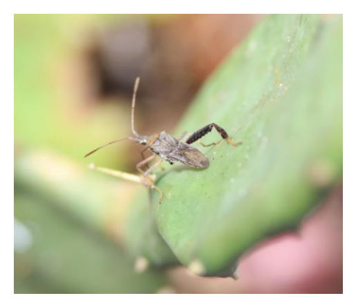
Figure 1: A male Narnia femorata missing his hind left leg. The leg was removed at the individual's autotomy fracture plane, which suggests that the limb was lost through autotomy (Miller).

Previous research on autotomy has focused on either the autotomy fracture plane or the latency to autotomize (Fox et al. , 1998; Bose, 2013), but both components have rarely been investigated simultaneously. From a biomechanics perspective, larger fracture planes require more force to break for a given autotomizable appendage (Fox et al. , 1994; Fox et al. , 1998, Marrs et al. , 2000, Gleason et al. , 2014, but see Prestholdt 2018 for force difference across autotomizable appendages, e.g., legs vs. claws). It is unclear, however, whether the size of the fracture plane affects the latency to autotomize. Individuals with larger fracture planes may, for example, have compensatory muscles that allow them to autotomize their limbs just as quickly. The lack of studies investigating the relationship between morphology and behavior is problematic because previous work has assumed that there is a positive relationship between the size of an autotomy fracture plane and the associated behavior – latency to autotomize. The aim of this study is to understand the degree to which autotomy fracture planes affect the latency to autotomize.