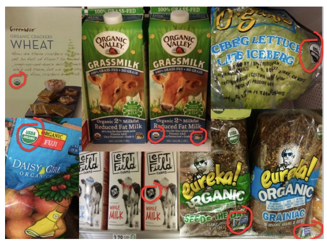
Figure 2. American Food Labels