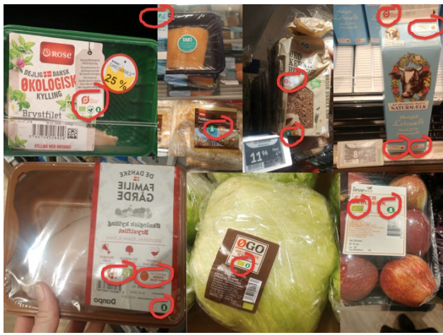
Figure 1. Danish Food Labels

After the online information was gathered and the grocery store surveys completed, pictures of the labels were collected and organized in order to best demonstrate representative labeling on each of the chosen food products. Tables were created to differentiate the American and Danish labels that were found to highlight major differences. The categories with the different labels were described to try to detect differences in organic certification and labeling in the United States vs. Denmark.