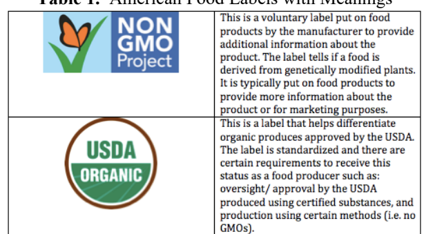
Table 1. American Food Labels with Meanings

Additionally, it was found that there is only one governmental standardized organic label in the United States, which is USDA Organic. The only other label that was found on many foods was a NON-GMO label, but this is not a governmentally sponsored label, but a label that companies can chose to add onto their products<sup>7</sup>. Whereas in Denmark, there are many labels which are governmentally regulated. The labels not only inform consumers of organic choices, but also healthier food options<sup>8</sup>. See Table 1 and Table 2, which demonstrate the labels, found in both the United States and Denmark and to find out what they represent.