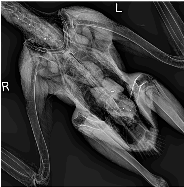
FIGURE 1 —Irregular, lead fragments are present in the crop and ventriculus of this California condor ( Gymnogyps californianus ). Liver lead concentration was 42.22 ppm wet weight. Muscle and hair within the crop were both determined to be of deer origin.

Components of the last meal were determined for 20 condors that died of lead toxicosis in the wild and 21 birds that died of other causes (TABLE 2). The variability of gut content character required the use of genetic and morphological techniques to identify the last meal. The most common food item taxon in this group was cervid (6), followed by equid (4), caprid (3), canid (2), bovid (1), and suid (1). One bird that had eaten deer had also fed on a goat before death. Cattle were more heavily represented in field mortalities not associated with lead toxicosis. Of the 21 birds that died of non-lead causes for which last meal was determined, bovid tissue was present in 10; cervid in 5; suid in 3; equid in 2; and leporid, canid, and ursid each in 1. Two different animals were present in the GI contents of 7 of these birds, and 1 bird had fed on 3 different species before death. These findings are similar to those of Kelly et al. (2014), which showed that increased independence from proffered feeding (generally bovid) was associated with a higher incidence of elevated blood lead concentrations during routine testing.